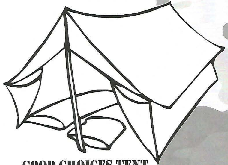
GOOD CHOICES TENT