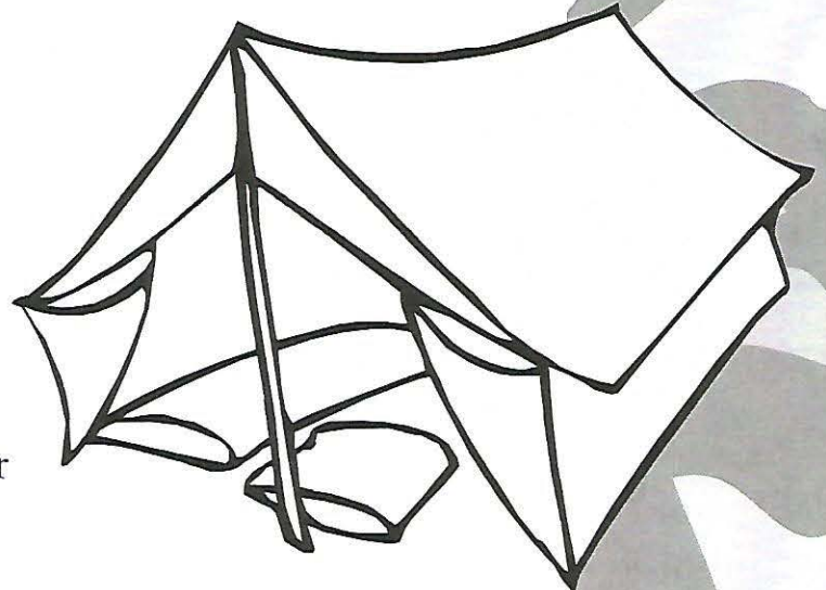
BAD CHOICES TENT